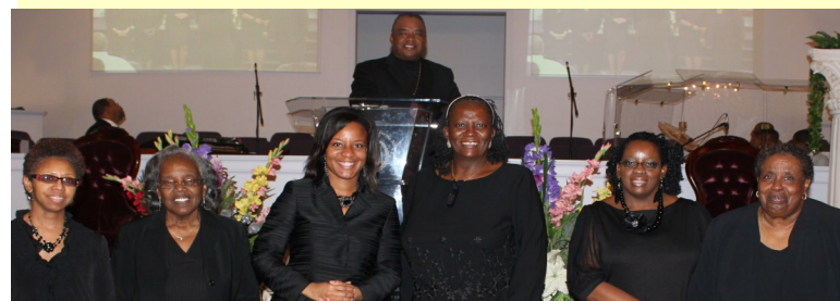
Program Ministry Annual Day Day of Rueben