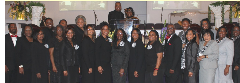
Hospitality and Pulpit Ministries Annual Day Day of Asher