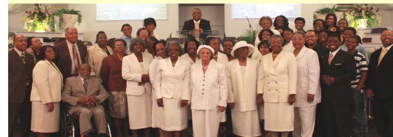
Church School, Sr. Missionary, Worship Team Annual Day