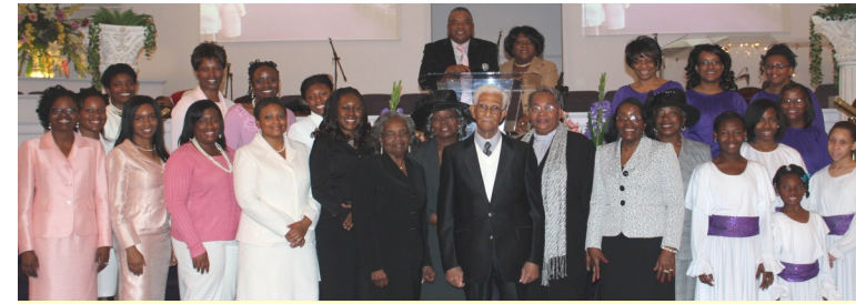
YWA, Golden Age, and Worship Dance Ministries Annual Day Day of Naphtali

"I enjoyed the seminar and everything was beautiful. The lesson was great and also the decorations. It was great to see we're at another level." God is truly taking us to another level. Every year it gets better and better. I'm so blessed to be apart of this ministry. God is good! Everything was beautiful!"